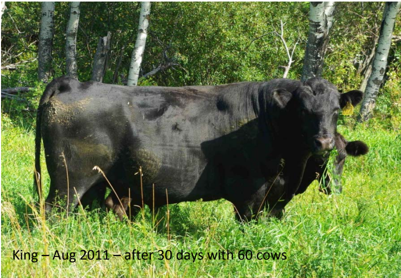
King – Aug 2011 – after 30 days with 60 cows

Sire: F V 20K King 308M (1117753) – AMF, NHF, CAF