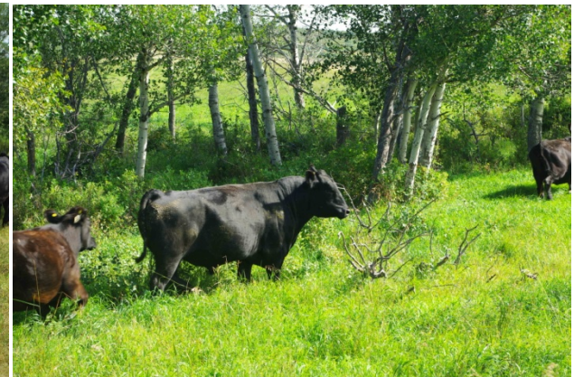
3 month old calves (Aug 2011)