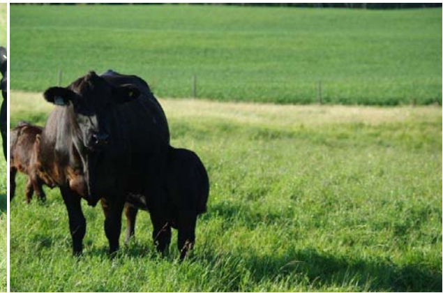
2 month old calves (July 2011)