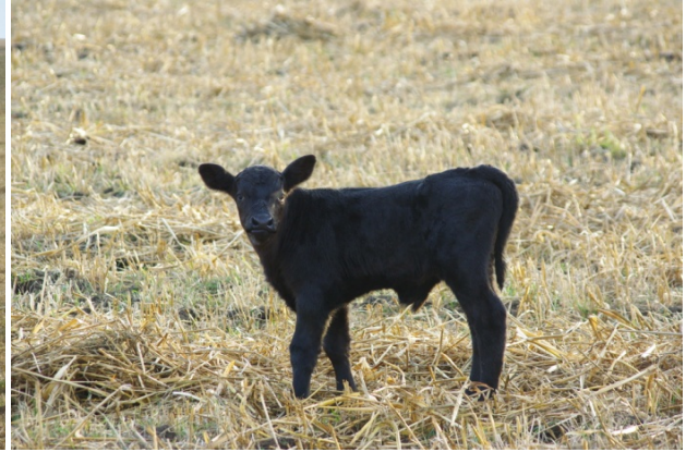
First calf heifers (May 2011)